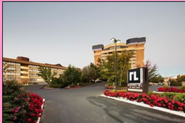
303 W. North River Drive, Spokane, WA 99201

The official hotel for the Miyagi Chojun Festival is the Red Lion Hotel Spokane at the Park & Convention Center, it is also the site for all training events. We have secured a special reduced rate for attendees and their families. Right in the heart of Downtown Spokane, The RLH at the Park & Convention Center is located within easy walking distance to variety of shops, theaters, restaurants and clubs.